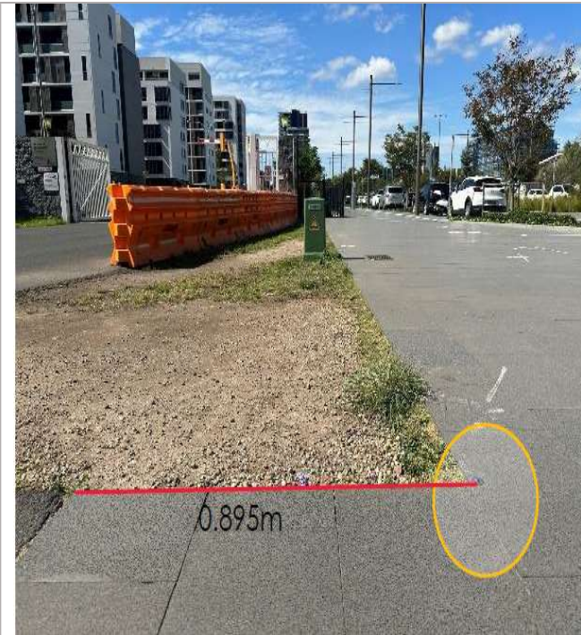
Facing east from Joynton Avenue Land shown at the narrowest width Zetland Avenue to right