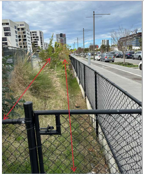
Facing east Zetland Avenue to right