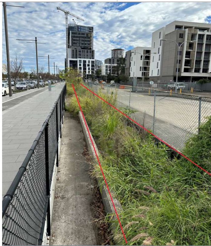
Facing west Green Square Town Centre background Zetland Avenue to left , Deicorp site to right